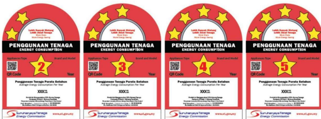
Figure 8 : Label design for 2-star to 5-star

THE REMAINDER OF THIS PAGE HAS BEEN LEFT BLANK INTENTIONALLY