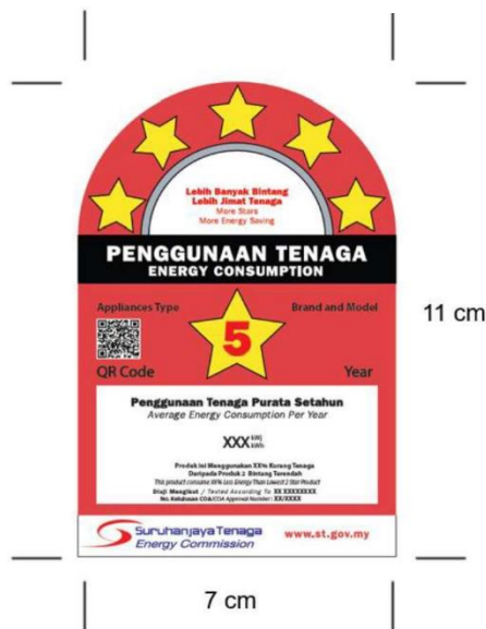
Figure 6 : Label size specification for Electric Oven