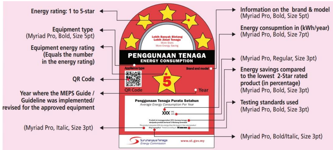
Figure 3 : Energy Efficiency Label

In accordance with the Energy Efficiency and Conservation Act, any equipment that meets all the requirements of efficient use of electricity shall be affixed with an efficiency rating label. It shall be the responsibility of the manufacturer or importer to affix such label. Information to be included in the label is as per Figure 3 .