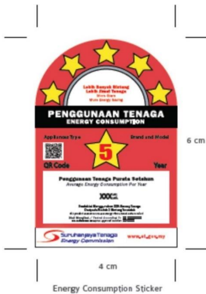
Figure 4 : Label size for rice cooker, microwave and fan

The size of the energy efficiency label is as per Figure 2 and Figure 3.